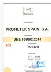
UNE 166002:2014 R&D&I management