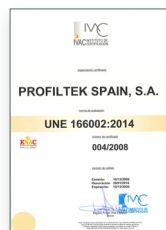
UNE 166002:2014 R&D&I management