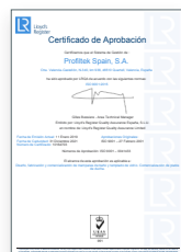
ISO 9001:2015 Quality Management System