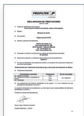
UNE-EN 14428:2016 Bath enclosures