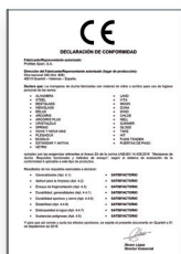
UNE-EN 14428:2016 Bath enclosures