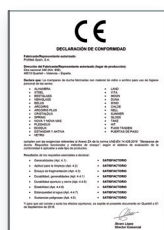
UNE-EN 14428:2016 Bath enclosures