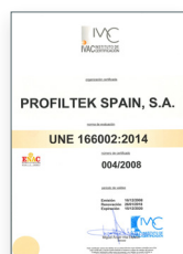
UNE 166002:2014 R&D&I management