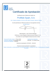
ISO 9001:2015 Quality Management System