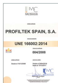
UNE 166002:2014 R&D&I Management