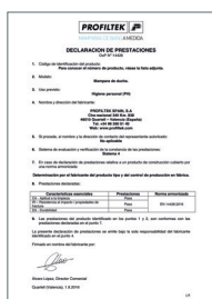
UNE-EN 14428:2016 Shower enclosures