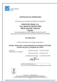
ISO 9001:2015 Quality management system