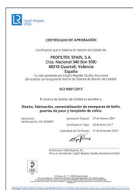
ISO 9001:2015 Quality management system