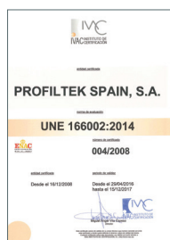
UNE 166002:2014 R&D&I Management