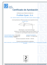
ISO 9001:2015 Quality Management System