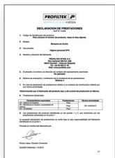
UNE-EN 14428:2016 Bath enclosures