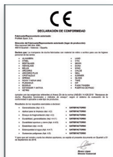
UNE-EN 14428:2016 Bath enclosures