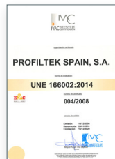
UNE 166002:2014 R&D&I management