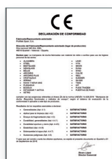
UNE-EN 14428:2016 Bath enclosures