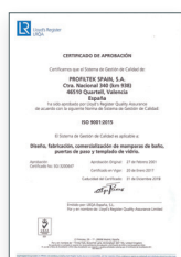
ISO 9001:2015 Quality Management System