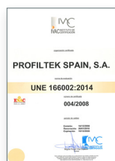
UNE 166002:2014 R&D&I management